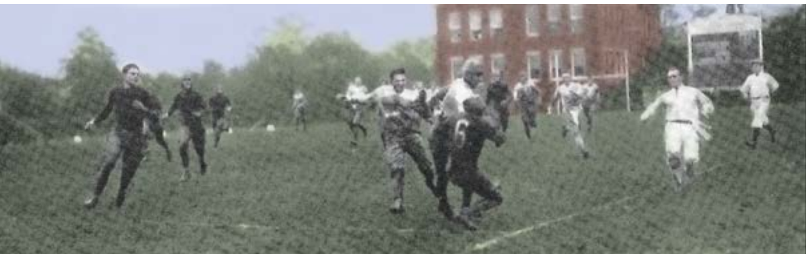
The Football Mocs, seen here playing Wofford in 1928, moved to Finley Stadium in 1997. What became of Chamberlain Field? Find out on page 18.